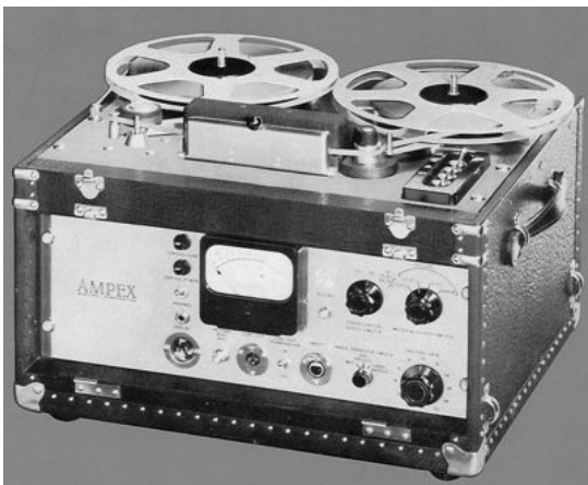
Fig. 7. Model 400A portable.