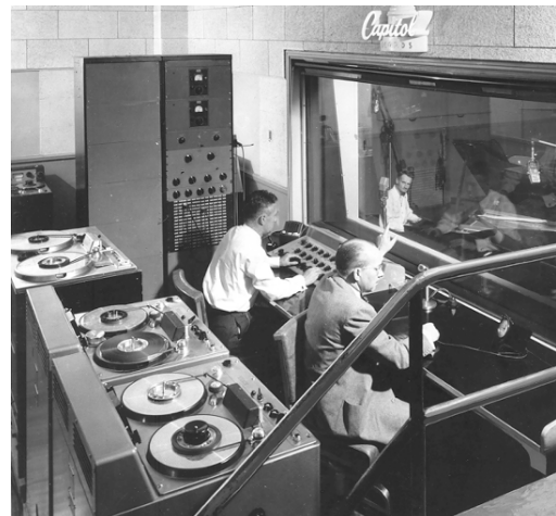
Fig. 6. Models 201 and 300 in use at Capitol Records.

By early 1949, the financial situation for Ampex had improved considerably as a result of shipments of the Model 200A and Model 201 conversion kits. Alex was now able to do something he had wanted to do for some time: hire Walter Selsted.