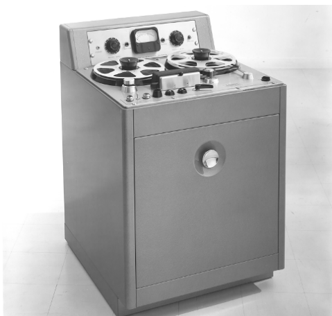
Fig. 5. Model 300.

For the Model 300, Harold did the mechanical part and Frank did all of the electronics, including the record/playback electronics.