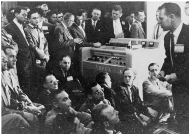
Fig. 10. Videotape recorder introduction, 1956, April 14.

When the Convention opened the following day, everyone had heard about the introduction of the Ampex videotape recorder at the CBS meeting, and Phil Gundy announced that