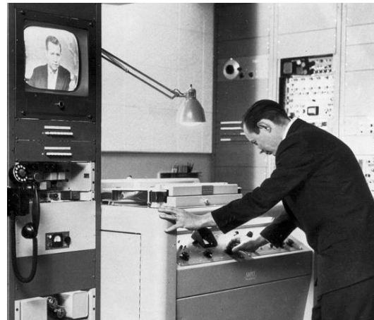
Fig. 11. CBS news anchor Douglas Edwards.