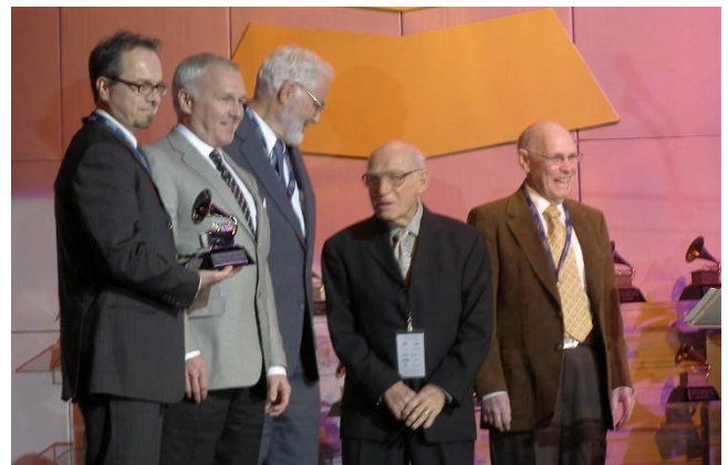
Fig. 13. Grammy award ceremony, 2008 February 9.