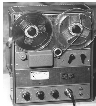
Fig. 8. Model 600.

The same year, Jack Wernli started development of the Model 600 series of products that was eventually introduced in 1954. The 600 used 7-inch reels. It was both portable and light weight at only 27 pounds. At 7.5 ips, its recording/playback quality equaled that of the Model 400.