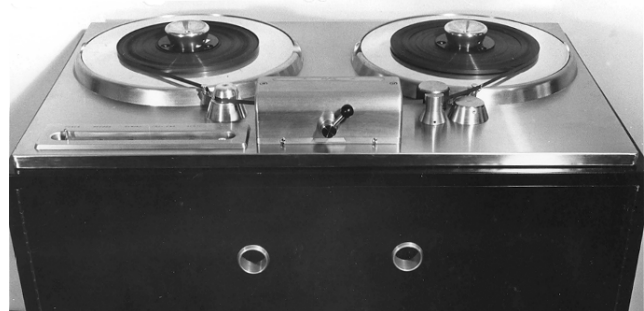
Fig. 4. Model 200A.

Ampex delivered the first production Model 200A in April, 1948, to Jack Mullin; the second recorder followed a few days later. Jack used serial numbers 1 and 2 for recording the Bing Crosby Show. Many of the rest of the first production run of 20 went to ABC in Chicago where they were used mainly for broadcast time delay. This was a revolutionary change for the